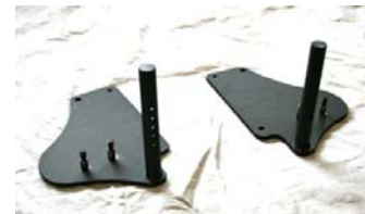
P100309 Recline Side Support