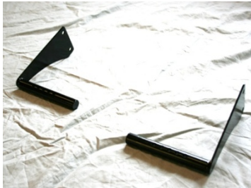
P100300 Headrest Mount