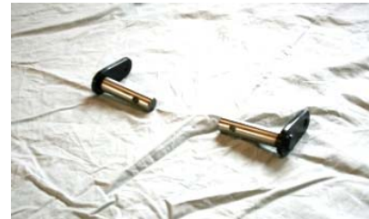
P100306 Canti Lever Swing Arm