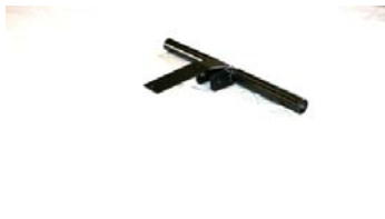
P100307 Recline Upper