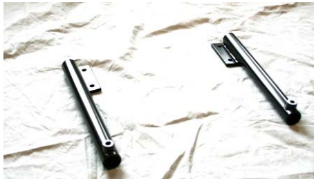
P100302 Recline Slide Tubes Outer