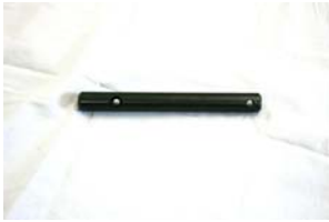
P100313 Tube Bracket