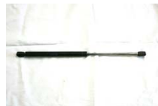
P100312 Gas Shock