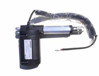
P100316 Actuator Magnetic (Older)