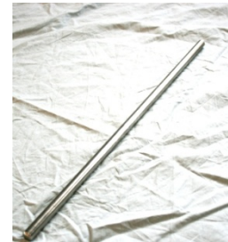
P100303 Recline Back Slide Tube Inner