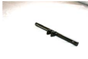
P100308 Lower Recline