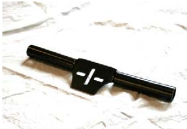
P100304 Headrest Mount