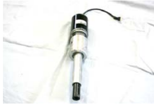
P100314 Stand Recline Actuator (Old)