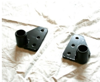
P100305 Canti Lever Arm Bracket