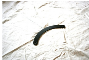
P100301 Sheer Pivot Rod