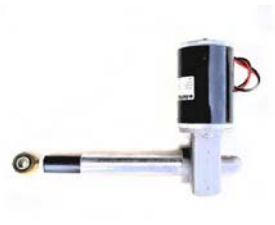
P100317 5inch Stand Recline Actuator (New)